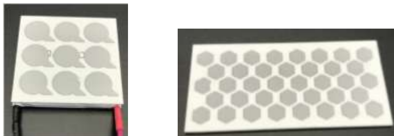
The printed surfaces are completely dry and easy to use

Application examples: Peltier element (TEC) printed with QC-PCM and printed Al 2 O 3 heat-conducting washer